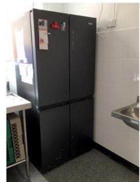
2023.8.4 - A new Haier,453 L, 4 door fridge

Another improvement is that we now have a smart new 4 door refrigerator in the kitchen. It replaces the old refrigerator which gave up after many years of faithful service. Thank you to those who made this happen!